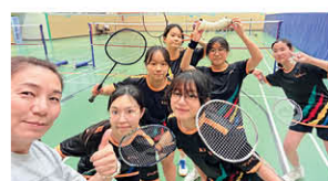
Badminton Team 羽毛球隊