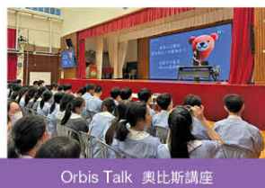
Orbis Talk 奧比斯講座