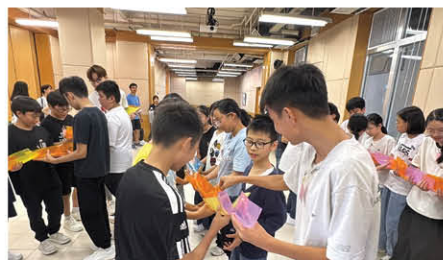
Life Camp 體驗日營