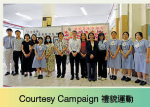
Courtesy Campaign 禮貌運動