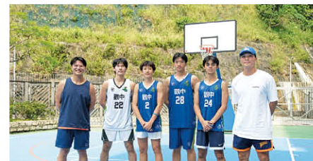
Alumni Basketball Competition 校友盃