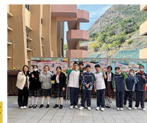
ICAC iTeen 校內推廣活動