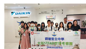
Osaka Expo Study Tour 日本大阪世博考察團