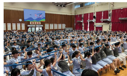
Towel Exercise Session with Senior Form students 高中「毛巾操」