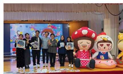
Alumni sharing 校友分享