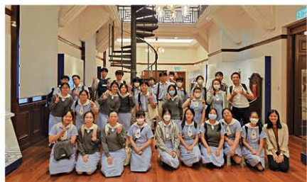
Field Trip 考察活動

Major Concern 2: Promoting students' well-being and leading a healthy and flourishing life through values education