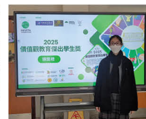
Outstanding Student Award for Values Education 2025 2025 年價值觀教育傑出學生獎