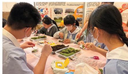
Craft making promoting healthy well-being 動物睡眠農莊