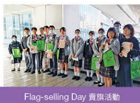
Flag-selling Day 賣旗活動