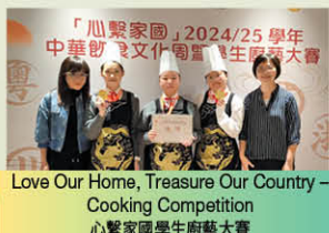
Love Our Home, Treasure Our Country – Cooking Competition 心繫家園學生廚藝大賽