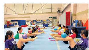
Rhythmic Gymnastics Team 藝術體操隊