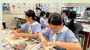
Ceramics Class 陶塑班