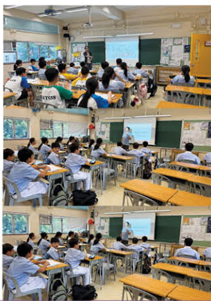
S1 ELSE Class

本校推行「中一級英文學習技巧提升班 (ELSE)」，讓學生逐步適應中學學習模式。本校牧護組專責統籌相關計劃，並向政府申請撥款開辦「英文學習技巧提升班」，發展學生以英語學習的能力，協助他們鞏固學習。