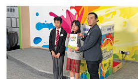
STEAM x BIM Construction Model Creative Design Competition STEAM x BIM 建造模型創意設計比賽