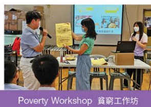
Poverty Workshop 貧窮工作坊