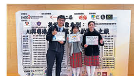
Beautiful Hong Kong Impressions AI-Generated Art Contest 美好香港印象：AI與香港文化的融合之旅 AI生成繪圖設計比賽