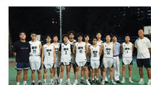
Basketball Team 籃球隊