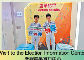
Visit to the Election Information Center 參觀選舉資訊中心