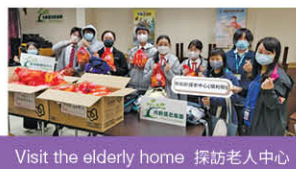
Visit the elderly home 探訪老人中心