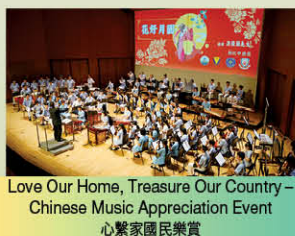
Love Our Home, Treasure Our Country – Chinese Music Appreciation Event 心繫家園民樂賞