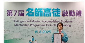
Distinguished Master Accomplished Students Mentorship Programme Kick-off Ceremony 名師高徒計劃