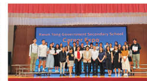
Career Expo 職業博覽