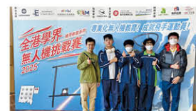
Hong Kong Inter-School Drone Challenge 全港學界無人機挑戰賽