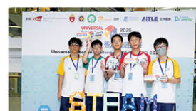
Universal Robotics Challenge 國際機械人挑戰賽