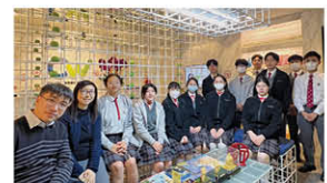
Visit Accounting firm 參觀會計公司