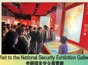
Visit to the National Security Exhibition Gallery 參觀國家安全展覽廳