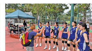
Volleyball Team 排球隊