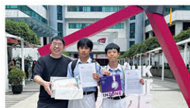
CityUHK-TKP GenAI Programme 香港城市大學田家炳生成式人工智能計劃

本校注重培養學生的科學探究和解決問題的能力，從日常生活出發，透過多樣化的 STEAM 活動讓學生關心社會和時事，培育能為社會做出貢獻的優秀人才。課程涵蓋人工智能、3D 打印、Arduino 等，為學生提供與社會接軌的技術，為將來升學和就業做好準備。此外，本校鼓勵學生積極參加與 STEAM 相關的培訓課程及活動，如 URC 機器人比賽、無人機群飛訓練、STEAM X BIM 建築設計比賽、人工智能繪畫比賽及人工智能創新比賽等。學生表現出色，多次獲得獎項，例如人工智能創新比賽銀獎及 AI 生成繪圖設計比賽中學組冠軍和亞軍等。本校還舉辦了日本大阪世博考察團，帶領學生走出香港，親身體驗世界博覽會中的高端科技，拓展國際視野。