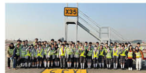
Visit to Hong Kong International Airport and the Hong Kong International Aviation Academy (HKIAA) 參觀香港國際航空學院