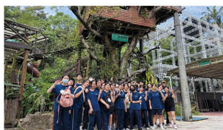
Tree House Adventure Training 樹屋歷奇訓練日