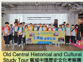
Old Central Historical and Cultural Study Tour 舊城中環歷史文化考察團