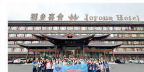
Firm visit at Dongguan 大灣區職業探索之旅 (東莞)