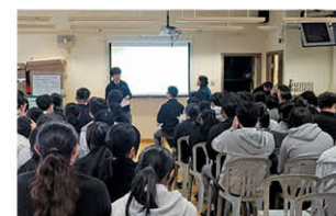
Moral Education Speech Contest Cherish your roots, embrace filial piety 德育演講比賽-惜根懷孝