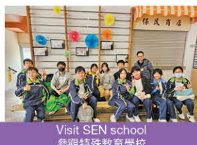
Visit SEN school 參觀特殊教育學校