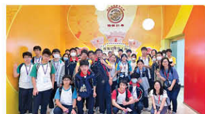
GBA Career tour 大灣區職業探索之旅 (東莞)