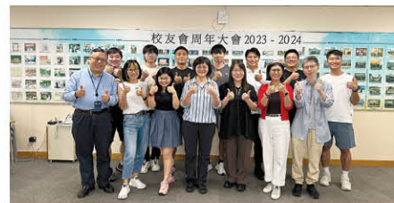
KTGSS Alumni Association AGM觀中校友會周年大會

本校校友會成立於 1987 年。校友會多年來均積極支持本校的各項活動，如周年會員大會、籃球比賽、羽毛球活動、燒烤晚宴及分享會等，致力於團結各校友，凝聚力量，與母校保持緊密的聯繫，讓觀中優良的傳統薪火相傳。