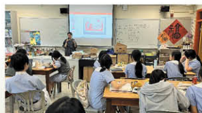
Artist-in-Residence Program 藝術家駐校計劃