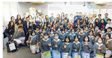
Art Inheritance Joint Art Exhibition 藝術傳承聯合展覽