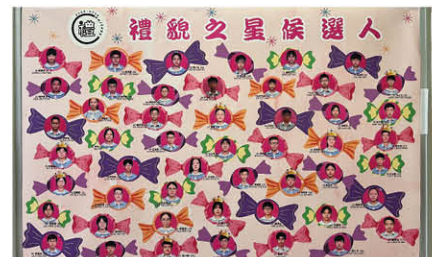
Courtesy Campaign 禮貌運動