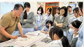
Art Gallery Visit 參觀藝術館