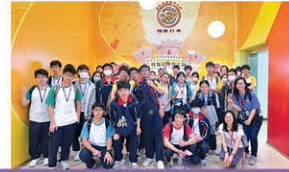
GBA Career tour 大灣區職業探索之旅 (東莞)