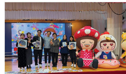
Alumni sharing 校友分享