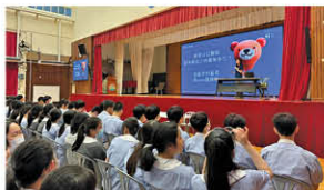
Orbis Talk 奧比斯講座