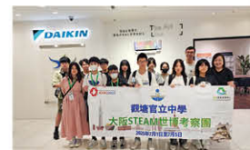
Osaka Expo Study Tour 日本大阪世博考察團