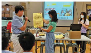
Poverty Workshop 貧窮工作坊