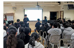
Moral Education Speech Contest Cherish your roots, embrace filial piety 德育演講比賽-惜根懷孝

本校採用多元策略，包括不同組別、不同學科課堂內外的學習，推動價值教育，例如德育演講比賽、德育攤位遊戲、自律班別比賽、名人或傑出校友專訪、個人發展獎勵計劃等活動，以及班主任課，潛移默化，感染學生，讓他們能夠通過日常實踐，深化知識，從而建立正向價值觀。