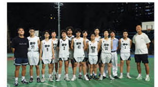
Basketball Team 籃球隊