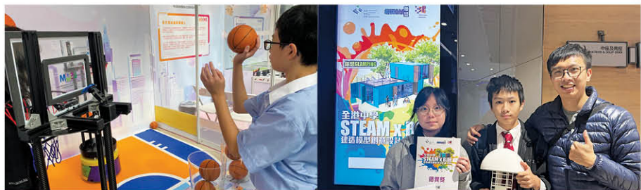
STEAM Activities and Competitions STEAM 活動及比賽