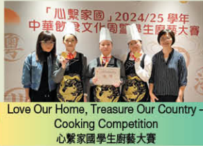
Love Our Home, Treasure Our Country - Cooking Competition 心繫家園學生廚藝大賽