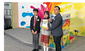
STEAM x BIM Construction Model Creative Design Competition STEAM x BIM 建造模型創意設計比賽