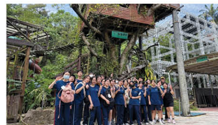
Tree House Adventure Training 樹屋歷奇訓練日