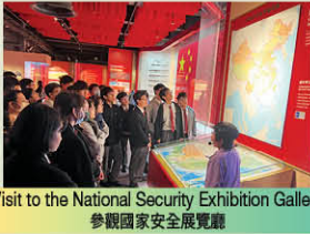
Visit to the National Security Exhibition Gallery 參觀國家安全展覽廳