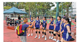
Volleyball Team 排球隊