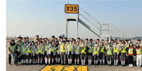
Visit to Hong Kong International Airport and the Hong Kong International Aviation Academy (HKIAA) 參觀香港國際航空學院