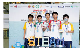
Universal Robotics Challenge 國際機械人挑戰賽