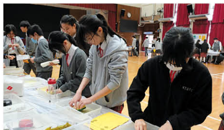
Science for All 全人科學