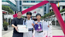
CityUHK-TKP GenAI Programme 香港城市大學田家炳生成式人工智能計劃

本校注重培養學生的科學探究和解決問題的能力，從日常生活出發，透過多樣化的 STEAM 活動讓學生關心社會和時事，培育能為社會做出貢獻的優秀人才。課程涵蓋人工智能、3D 打印、Arduino 等，為學生提供與社會接軌的技術，為將來升學和就業做好準備。此外，本校鼓勵學生積極參與與 STEAM 相關的培訓課程及活動，如 URC 機器人比賽、無人機群飛訓練、STEAM X BIM 建築設計比賽、人工智能繪畫比賽及人工智能創新比賽等。學生表現出色，多次獲得獎項，例如人工智能創新比賽銀獎及 AI 生成繪圖設計比賽中學組冠軍和亞軍等。本校還舉辦了日本大阪世博考察團，帶領學生走出香港，親身體驗世界博覽會中的高端科技，拓展國際視野。