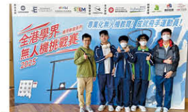
Hong Kong Inter-School Drone Challenge 全港學界無人機挑戰賽