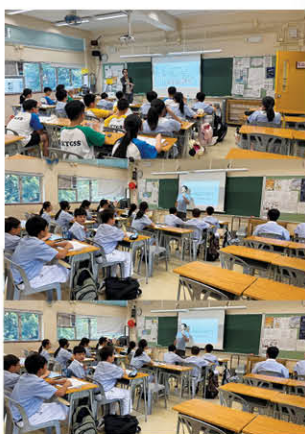
S1 ELSE Class

本校推行「中一級英文學習技巧提升班 (ELSE)」，讓學生逐步適應中學學習模式。本校牧護組專責統籌相關計劃，並向政府申請撥款開辦「英文學習技巧提升班」，發展學生以英語學習的能力，協助他們鞏固學習。