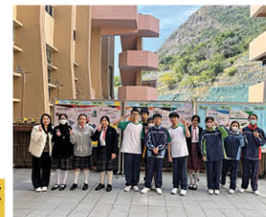
ICAC iTeen 校內推廣活動