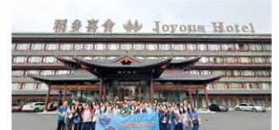
Firm visit at Dongguan 大灣區職業探索之旅 (東莞)