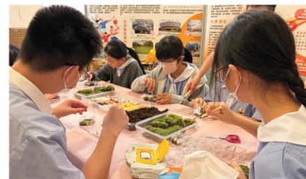
Craft making promoting healthy well-being 動物睡眠農莊