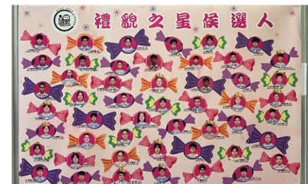
Courtesy Campaign 禮貌運動