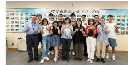
KTGSS Alumni Association AGM觀中校友會周年大會

本校校友會成立於 1987 年。校友會多年來均積極支持本校的各項活動，如周年會員大會、籃球比賽、羽毛球活動、燒烤晚宴及分享會等，致力於團結各校友，凝聚力量，與母校保持緊密的聯繫，讓觀中優良的傳統薪火相傳。