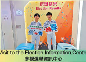
Visit to the Election Information Center 參觀選舉資訊中心