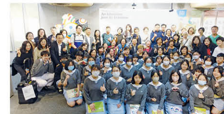
Art Inheritance Joint Art Exhibition 藝術傳承聯合展覽