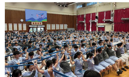
Towel Exercise Session with Senior Form students 高中「毛巾操」