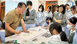
Art Gallery Visit 參觀藝術館