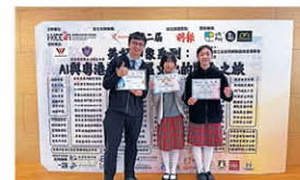
Beautiful Hong Kong Impressions AI-Generated Art Contest 美好香港印象：AI與香港文化的融合之旅 AI生成繪圖設計比賽