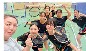
Badminton Team 羽毛球隊