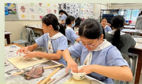
Ceramics Class 陶塑班