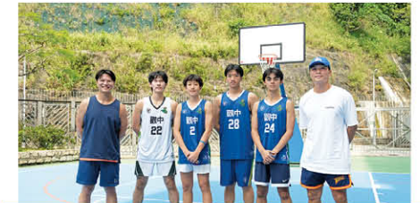
Alumni Basketball Competition 校友盃