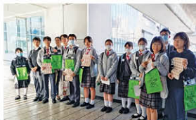
Flag-selling Day 賣旗活動