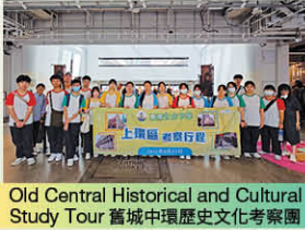
Old Central Historical and Cultural Study Tour 舊城中環歷史文化考察團