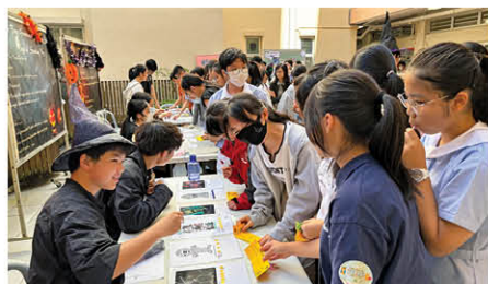
English Activities 英語活動