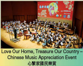
Love Our Home, Treasure Our Country - Chinese Music Appreciation Event 心繫家園民樂賞