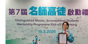
Distinguished Master Accomplished Students Mentorship Programme Kick-off Ceremony 名師高徒計劃