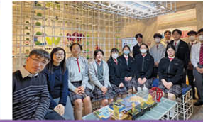
Visit Accounting firm 參觀會計公司