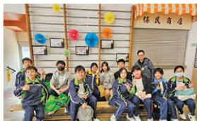
Visit SEN school 參觀特殊教育學校