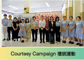
Courtesy Campaign 禮貌運動