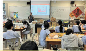
Artist-in-Residence Program 藝術家駐校計劃