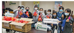
Visit the elderly home 探訪老人中心