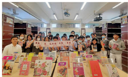
Book Exhibitions and Reading Activities 書展及閱讀活動