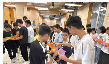
Life Camp 體驗日營