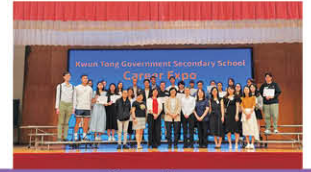
Career Expo 職業博覽