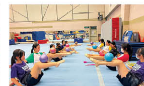
Rhythmic Gymnastics Team 藝術體操隊