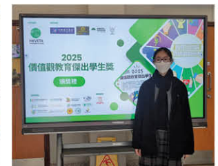
Outstanding Student Award for Values Education 2025 2025 年價值觀教育傑出學生獎