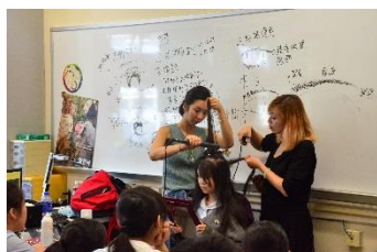
Workshops with professionals