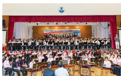
Chinese and Western Orchestra