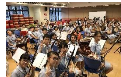
An outreach programme to primary schools

Clear teaching and learning objectives have been put into play to enable sustainable development in Arts Education. This academic year, a school-based cross-curricular project has been launched and an outreach program to primary schools (Kowloon Bay St. John The Baptist Catholic Primary School and Jordon Valley St. Joseph Catholic Primary School) has been implemented to ensure a rippling effect on the promotion of arts education.