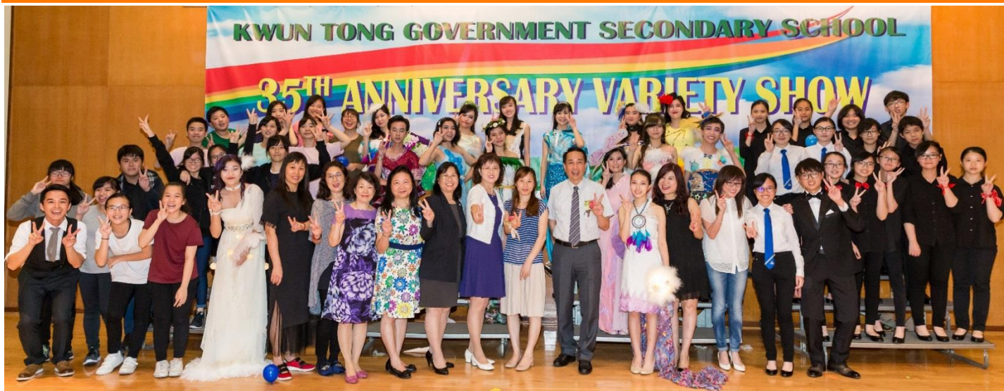
Cast, production crew, trainers and guests at the Variety Show